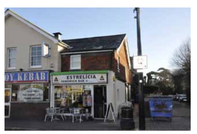
No. 41 High Street

Built in 1891. This was the original bandstand which stood at Gatwick Racecourse. The racecourse was built after Queen Victoria banned all race meetings in London during the 1880s because of hooliganism. The racecourse now lies under Gatwick Airport and the last meeting was in 1948. It is assumed that the bandstand was moved to this location when the New Town centre was constructed in the 1950s.