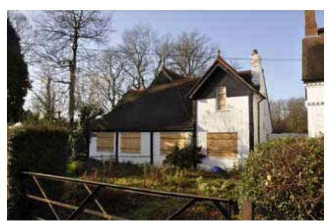
Ancillary building, potentially former School Master's house