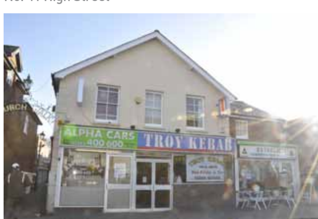
No. 43 High Street