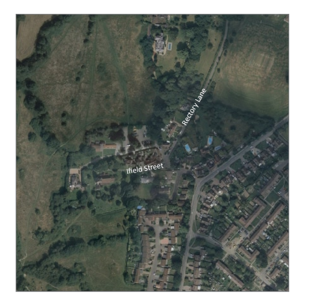
Fig 20: Character Area details: Historic Settlements Photos - Ifield