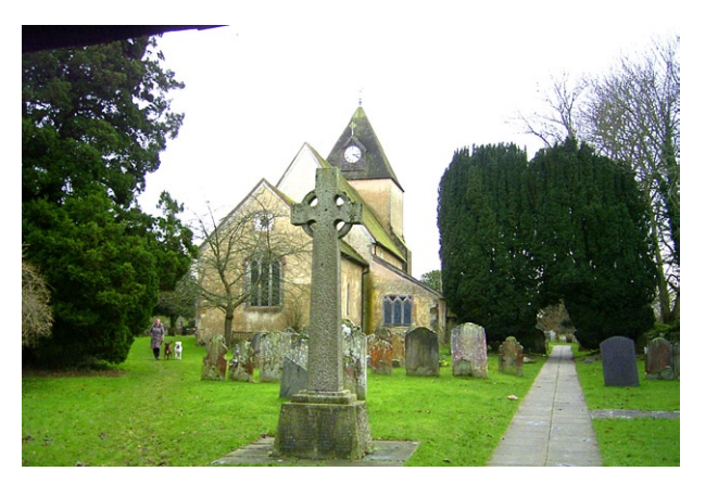
IMG_0290 Ifield Street, Ifield