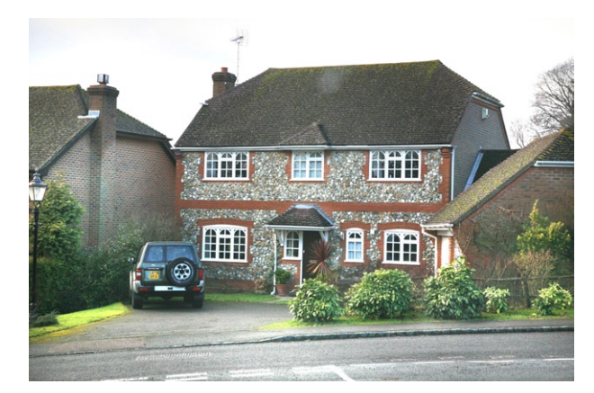
IMG_3971 Worth Way / St Hill / Church Road Worth