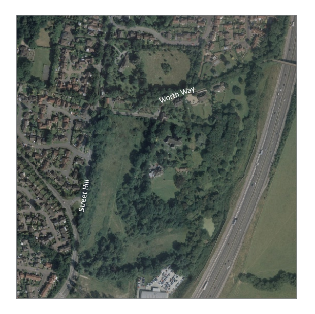
Fig 20: Character Area details: Historic Settlements Photos - Worth