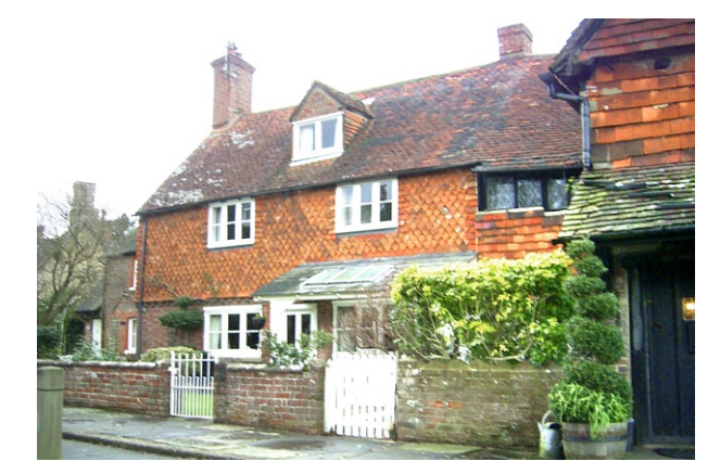
IMG_0289 Ifield Street, Ifield