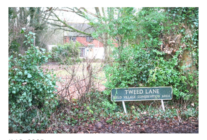
IMG_3205 Tweed Lane / Rectory Lane Ifield