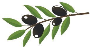
Monday collections (Olive week)

Your GREENbin collection day is a Monday