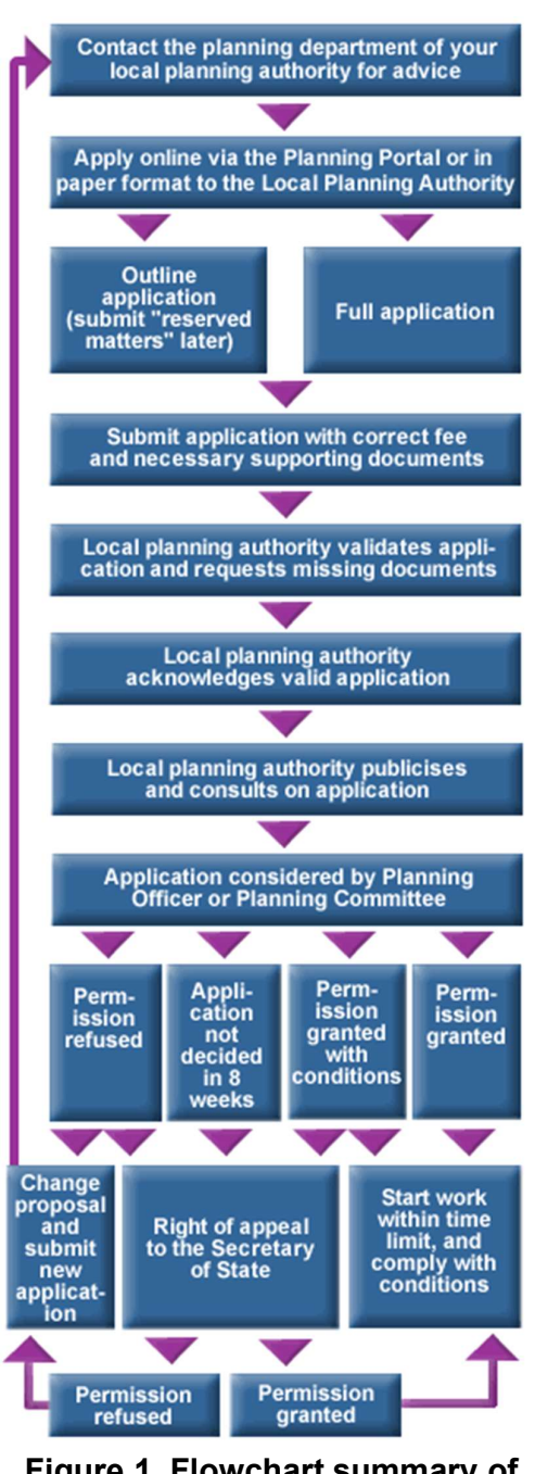
Figure 1. Flowchart summary of application process

A completed application form submitted either electronically or in writing on the correct national standard application form.